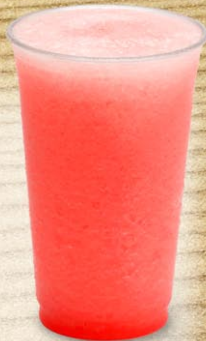
Cherry Flavored Shaved Ice -one of many flavors available